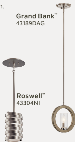
Grand Bank™ 43189DAG